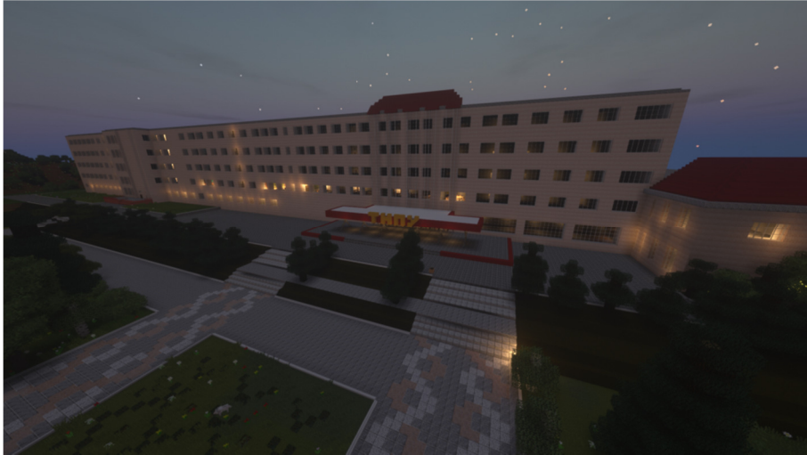
Figure 4. TNPU building's Reproduction

The construction of Terebovlia's Castle and the main building of Ternopil Volodymyr Hnatiuk National Pedagogical University were completed in such a project's group (see Figs. 3, 4).