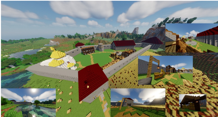
Figure 3. Terebovlia's Castle Reconstruction in Minecraft