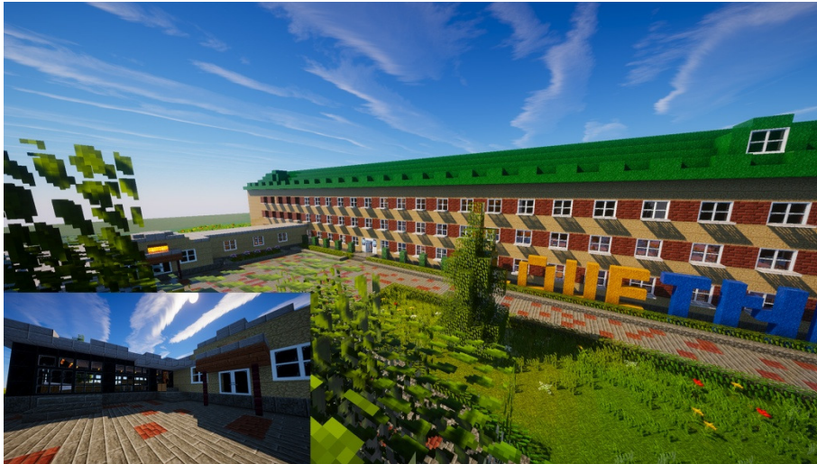
Figure 5. Faculty of Physics and Mathematics Building's Reproduction

The popularity of project and game activities among first-year students contributed to the involvement of such students in the specialty «Secondary education. Computer science» (ten people). They developed the building of the Faculty of Physics and Mathematics of TNPU (see Fig. 5).