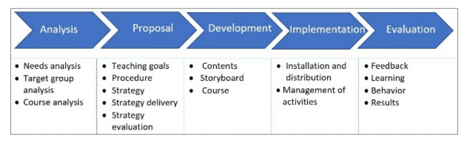
Figure 1. ADDIE model designing the e-learning [9]

In the designing of an e-learning, we used model ADDIE [9], consisting of five phases: Analysis, Design, Development, Implementation and Evaluation (Fig. 1).