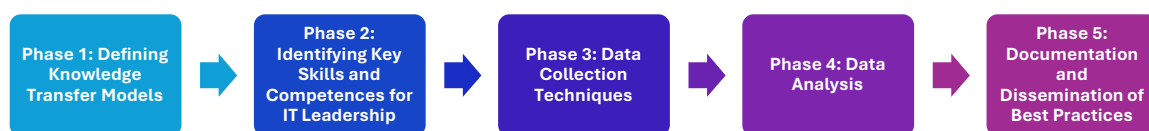
Figure 1. Methodological Framework

The methodological framework (Figure 1) is built around phases to collect and analyze data on knowledge transfer practices and leadership development.